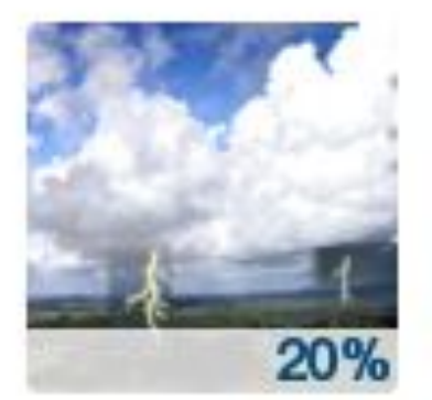
Slight Chance T-storms