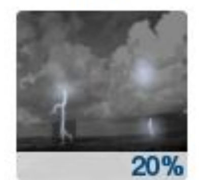
Slight Chance T-storms