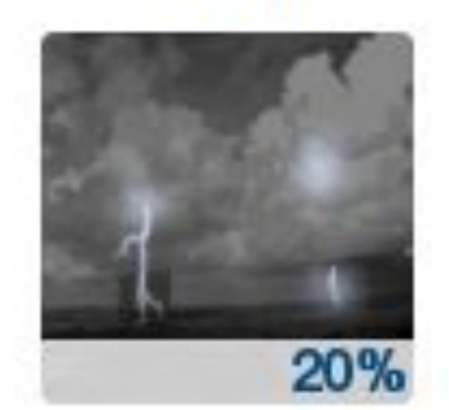
Slight Chance T-storms